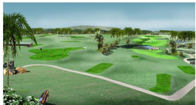
View of Golf Hole #1 Paraiso, Ancon Republic of Panama